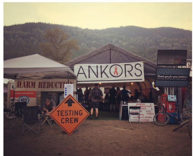
5/10/2022 BC Coroners Service Death Review Panel: A Review of Illicit Drug Toxicity Deaths, 2022 BC Coroners Illicit Drug Toxicity Deaths in BC, 2022

This review found that 35% of those who died were employed at the time of their death, and over half of those employed worked in the trades, transport or as equipment operators. This review also found a high correlation between illicit drug toxicity deaths and persons living in poverty or experiencing housing instability with 44% receiving social assistance within a month of their death, 19% living in social housing, hotels/motels, rooming houses or shelters. 12% were homeless